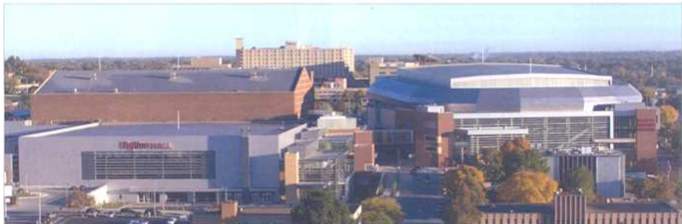
■ The Iowa Events Center in Des Moines has the Wells Fargo Arena, Hy-Vee Hall and Veterans Memorial Auditorium.

By examining the federal government's 2008 Domestic Per Diem Rates for meals and incidentals, Smith Travel Research's survey of domestic hotel rates and Tradeshow Week's 2008 Survey of U.S. and Canadian Labor Rates, TSW editors determined what could be the most affordable U.S. cities to hold tradeshow in. The top three destinations? Des Moines, Iowa; Columbus, Ohio; and Louisville, Ky.