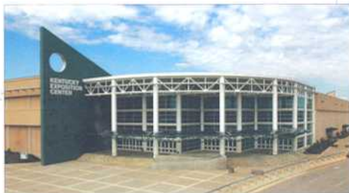
■ The Kentucky Exposition Center offers 1.2 million sq. ft.