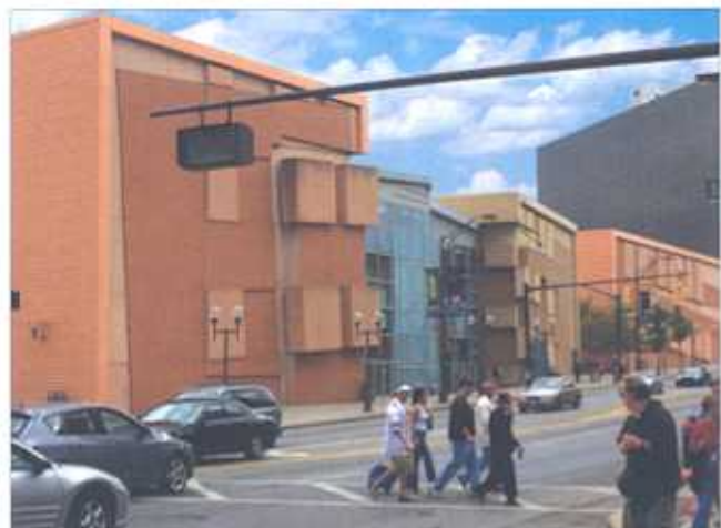
■ The Greater Columbus Convention Center has more than 426,000 sq. ft. and a freeway exit leading to loading docks.