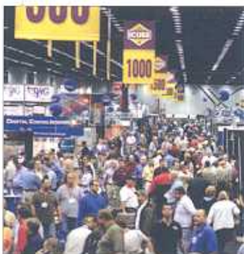
■ ICUEE, scheduled Oct. 6-8, 2009, is expected to use 1.22 million sq. ft. at the Kentucky Exposition Center.

ICUEE, scheduled Oct. 6-8, 2009, is expected to have 1.22 million sq. ft., 950 exhibitors and approximately 20,000 exhibiting personnel and attendees. Magestro said the show has been unable to find another city that has the large amount of space needed, enough to demonstrate all the equipment that is on display, and is as affordable as Louisville is.