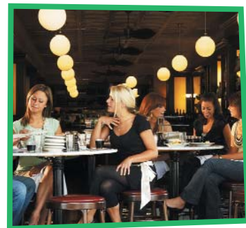
Have fun during dinner in the Short North

Create your own wine from start to finish at Camelot Cellars on-premise winery. Begin at the fermentation process, then bottle, cork and even design the label for your own private wine reserve.