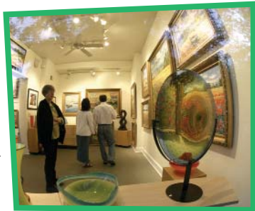
Explore the Short North

Enjoy dinner in the Short North. Your choices include cuisines ranging from Pan-Asian to All American. Later, kick back at one of the many happening bars in the Short North. For a more quiet night, sip on a glass of wine at the Burgundy Room , known for its extensive wine list, or grab a coffee or cocktail at MoJoe Lounge .