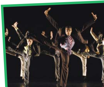
See innovative dance by BalletMet

After hitting the shops, relax with a full-body massage or any number of indulgent treatments at one of the many spas at Easton .