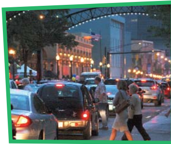
Lit arches illuminate the Short North Arts District

Park at Lincoln and High Streets across from Jeni's Splendid Ice Creams. Just look up to marvel at the beautiful High Street arches , which start at Poplar near The Cap at Union Station and go to Smith Street just past Fifth Avenue. Rebuilt in 2002, these arches are reminiscent of their original 1888 predecessors. The twist is that their high-tech wiring allows them to pulse, fade and flicker in a multitude of colors.