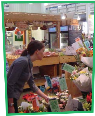
Shop at the North Market

Head to the front of the park (towards High Street). You will hit Park Street. Follow Park Street through the Goodale Street intersection. Before long, you will come to the North Market , 59 Spruce St. Since 1876 butchers, bakers, fishmongers and green grocers have filled the North Market. Stop in for an eclectic lunch.