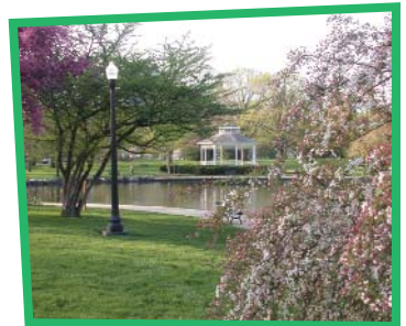
Stroll through Goodale Park