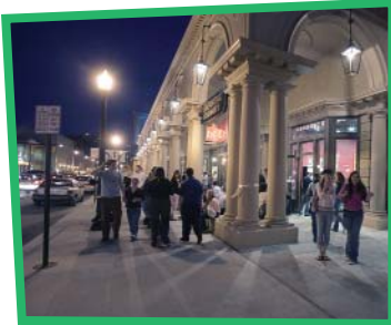
Have fun at The Cap

Exit the North Market's large parking lot and get back on High Street. Turn left once you are on High Street and you will soon come to the Annunciation Greek Orthodox Cathedral , 555 N. High St. Noted for its interior and exterior magnificence, the Greek Orthodox Cathedral is the hub of Columbus' Greek community. The core of this building dates back to 1922.